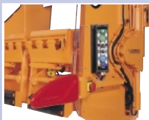
The unobtrusive, EN1501-1 conforming side guards make the TCA-DEL extremely operator friendly