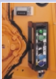
The diagnostic system with text display allows easy fault correction to minimise down time