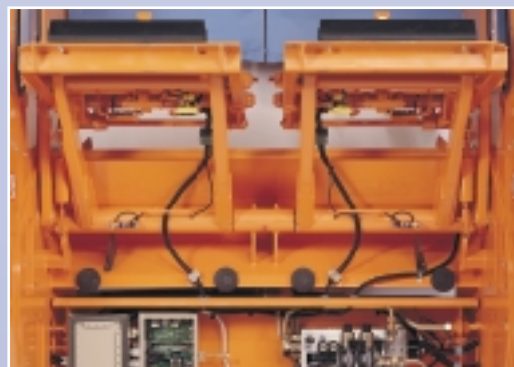
The compact service box contains the hydraulic system and the electrical system sealed in an IP67 waterproof box.