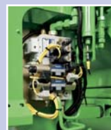
Gemakkelijk bereikbaar hydrauliekblok