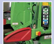
Overzichtelijk bedienings-paneel en gemakkelijk bereikbare noodstopknop